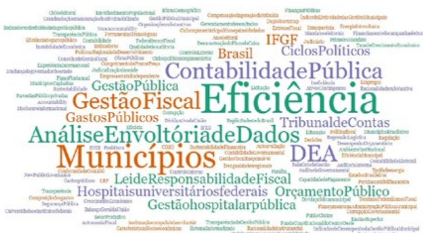
Figure 1. Keywords cloud: publications

Figure 3 presents the analysis regarding keywords to identify the studies converted into publications; 152 terms were identified.