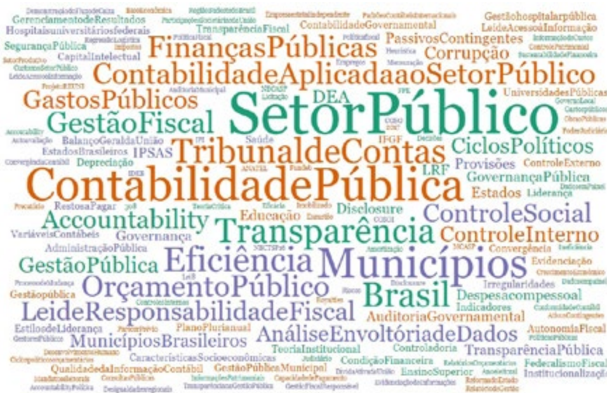
Figure 1. Keywords cloud: studies presented at ANPCONT

The most recurring keywords in the bibliographic portfolio were analyzed to identify the topics most frequently addressed by the studies in the PSA field presented at the ANPCONT Congress; 676 keywords were identified. Figure 1 displays a cloud formed with these keywords.